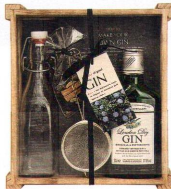
Marks & Spencer Infuse Your Own Winter Gin set, £20 (marksandspencer.com)