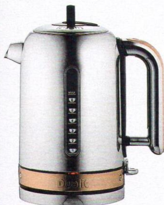
Dualit classic kettle in copper, £129.95 (johnlewis.com)