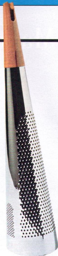
Alessi Todo giant grater, £49 (alessi.com)