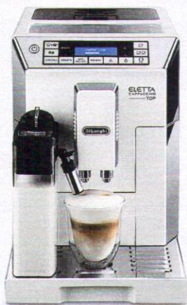
Eletta bean-to-cup Cappuccino Top, £899 (delonghi.com)