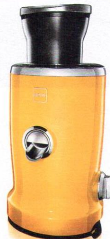
Novis Vita Juicer, £349 (harrods.com)