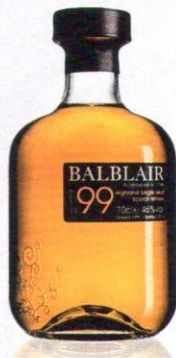
Balblair 99 vintage whisky, £59.35 (masterofmalt.com)