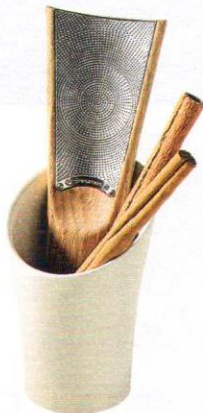
Cinnamon Lovers Grater Pack, with fresh Ceylon and Saigon cinnamon, £46 (cinnamonhill.com)