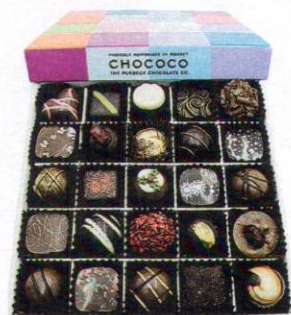
Chococo festive selection box (25 chocolates and truffles), £17.95 (chococo.co.uk)